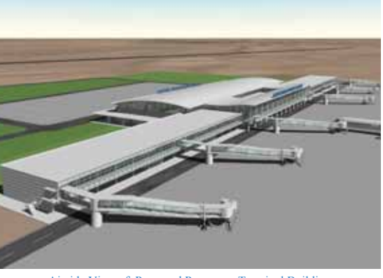
Airside View of Proposed Passenger Terminal Building