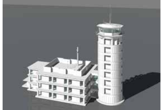
Proposed ATC Tower